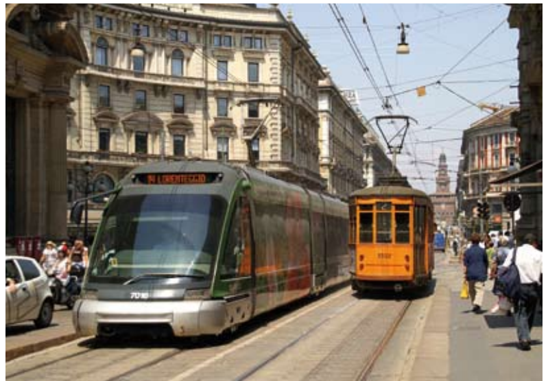
Formerly used cross-city as with 7016 at Piazza Cordusio in June 2007, Eurotrams are now a mainstay of Metrotramvia South line 15.

Metrotramvia is an integrated rather than free-standing format (nor is it separately designated on vehicles) and like earlier lines has turning facilities for the uni-directional tram fleet. At the modern northern end of line 7, this is within Precotto depot, the newest of five on the system, which opened in 2007 on the existing ATM metro maintenance site. Its functional structure contrasts with the bold architecture of the Messina depot built in 1912; just off lines 12 and 14 near Cenisio/Messina stop. ATM also operates three trolleybus lines and over 1100km (660 miles) of bus routes in greater Milan. TAUT