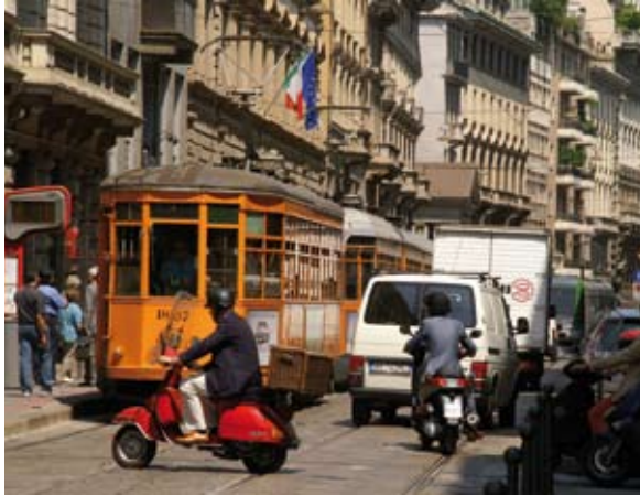
Trams edge towards Piazza Cordusio intersection in central Milan on 25 June 2007.