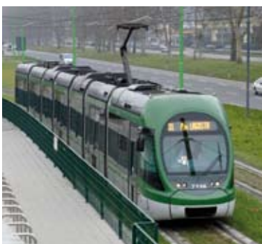
Left: Sirio 7138 approaches Parco Nord/Centro Scolastico on the Metrotramvia 31 line.