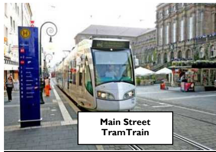
Main Street TramTrain