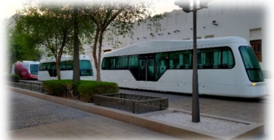
City Cars (3) autonomously coupled, 300 passengers