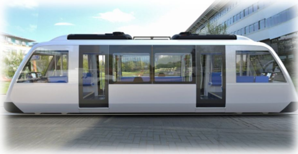
A Coventry VLR example.

Liverpool City Region, The North West showcase doorway