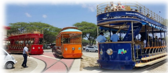
Self-powered new build tradition summer tram cars