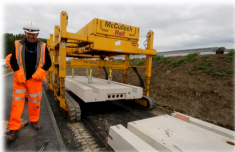
*Precast Advanced Track Installation less than £10M per Km

This is achieved by taking advantage of cutting-edge materials, while still making use of standard rail parts