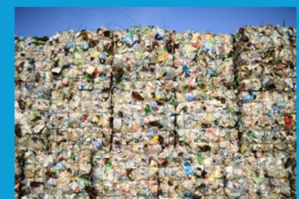
Plastic Waste Ex Leith Project

Green Hydrogen from Waste and Revenue sources for Edinburgh South Suburban Regeneration.