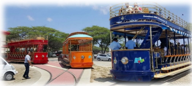
Self-powered new build tradition summer tram cars

(Trams are genuine zero emission vehicles at point of use!).