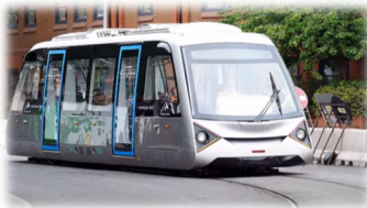
A Coventry VLR running x 56 Pax Can be autonomous