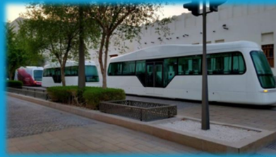
Hydrogen MC3 Trams x 100 pax x 3