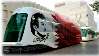
Doha VLR in Service x 100 Pax can be autonomously coupled x 3 cars

Trams have a proven record of getting people out of their cars whilst producing zero emissions and particulates at point of use and that these very light rail* (VLR) offers significant potential for enabling these benefits to be realised on a significant larger scale.