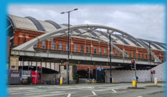
Access Bow String Bridge