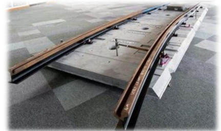
*Ingerop and its UK subsidiary Rendel. 30 cm into the road surface Installation less than £10M per Km