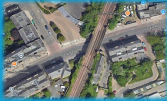
Gorgie Road Access

TRITON Hydrogen Solving Impossible Problems