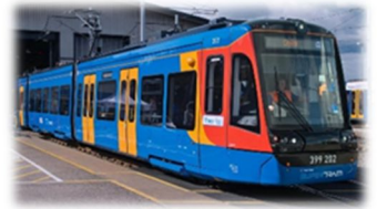
Sheffield Super Tram x Stadler Citylink Class 399 x 236 Pax

Trams have a proven record of getting people out of their cars whilst producing zero emissions and particulates at point of use and that these very light rail* (VLR) offers significant potential for enabling these benefits to be realised on a significant larger scale.