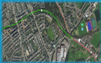
P+R Cameron Toll