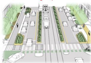
Reality of road space reallocation

Light Rail (UK) E-mail Jimh@jimmyharkins.com