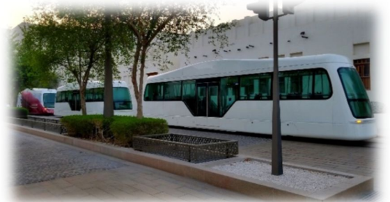
City Cars (3) autonomously coupled, 300 passengers