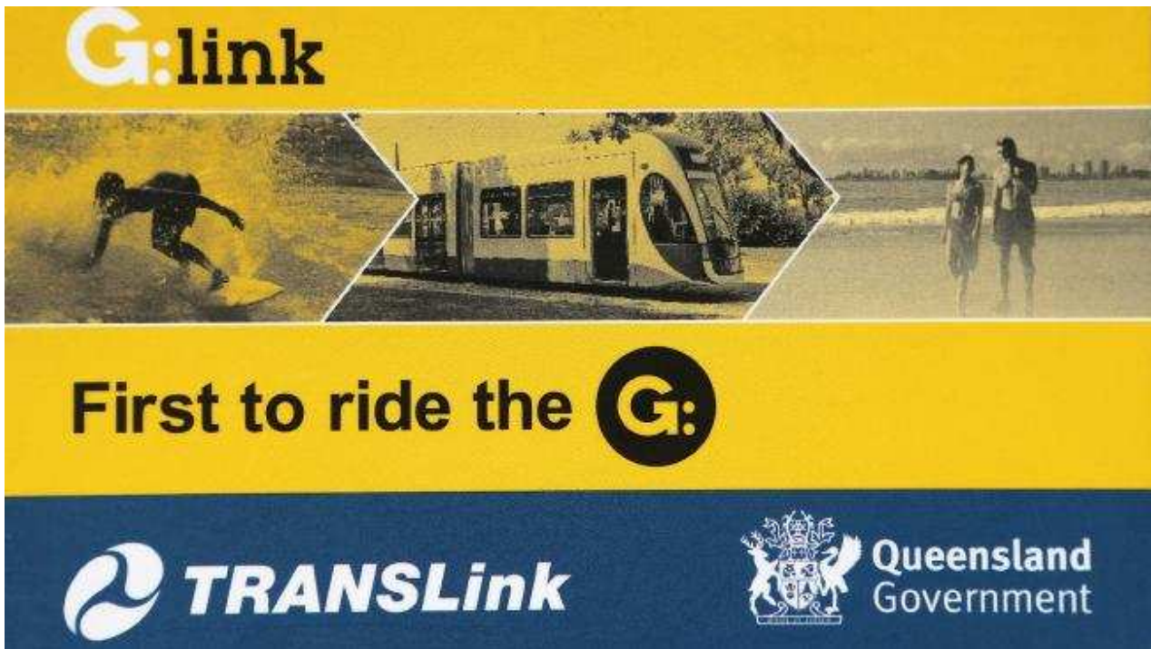
Original first G tram ride ticket.