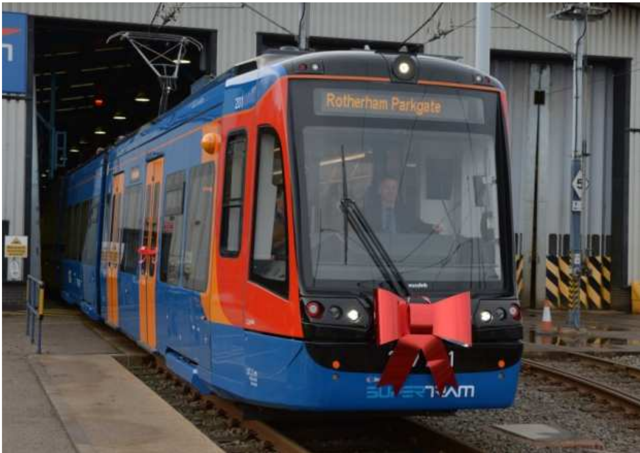
The launch of the new TramTrain.