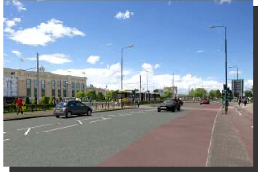
Artists impression of the proposed Trafford Centre Stop