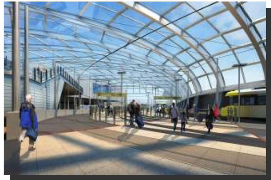
Artists impression of the Victoria Station