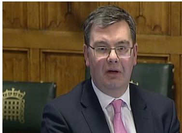
Iain Stewart MP.