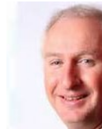
Mr Daniel Zeichner MP