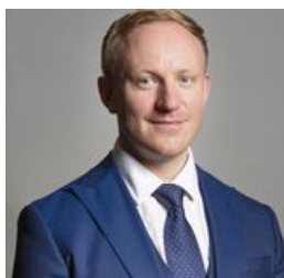
Sam Tarry MP

This meeting by invitation only, where MPs, Stakeholders etc., within the Light Rail industry and invited members of the Public will have a chance to discuss, debate and raise questions concerning Light Rail & Trams.