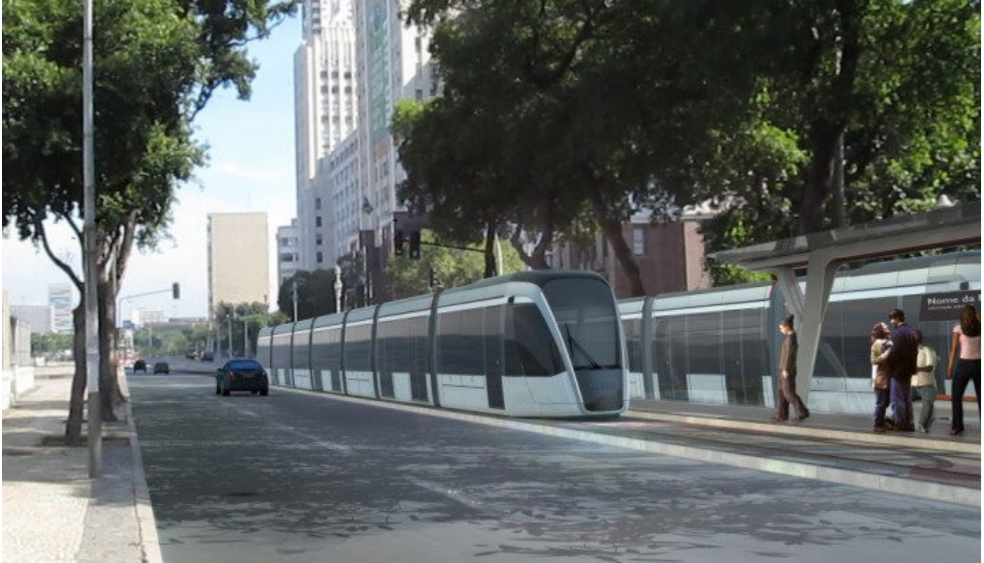
27 Mar, 2015

The first track segment of a new VLT light rail system in Rio de Janeiro has been laid.