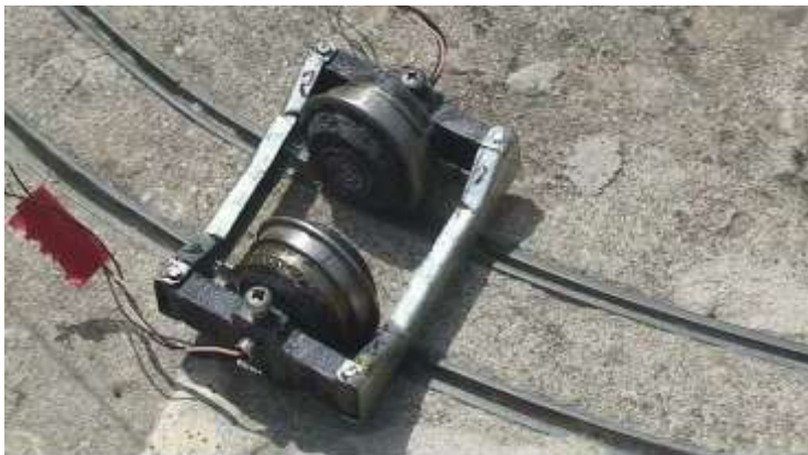
Miniature steerable wheel-motor set.