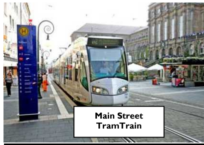
Main Street TramTrain