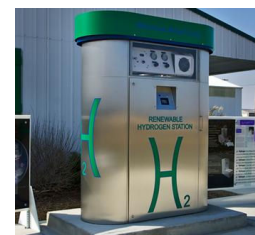
Hydrogen Power Unit

https://www.youtube.com/watch?v=j8DL160x0m8